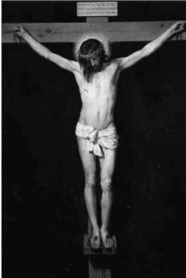
Christ Crucified , by Diego Velasquez, circa 1632 a.d.

Into your hands, Most Holy One, I commend my spirit