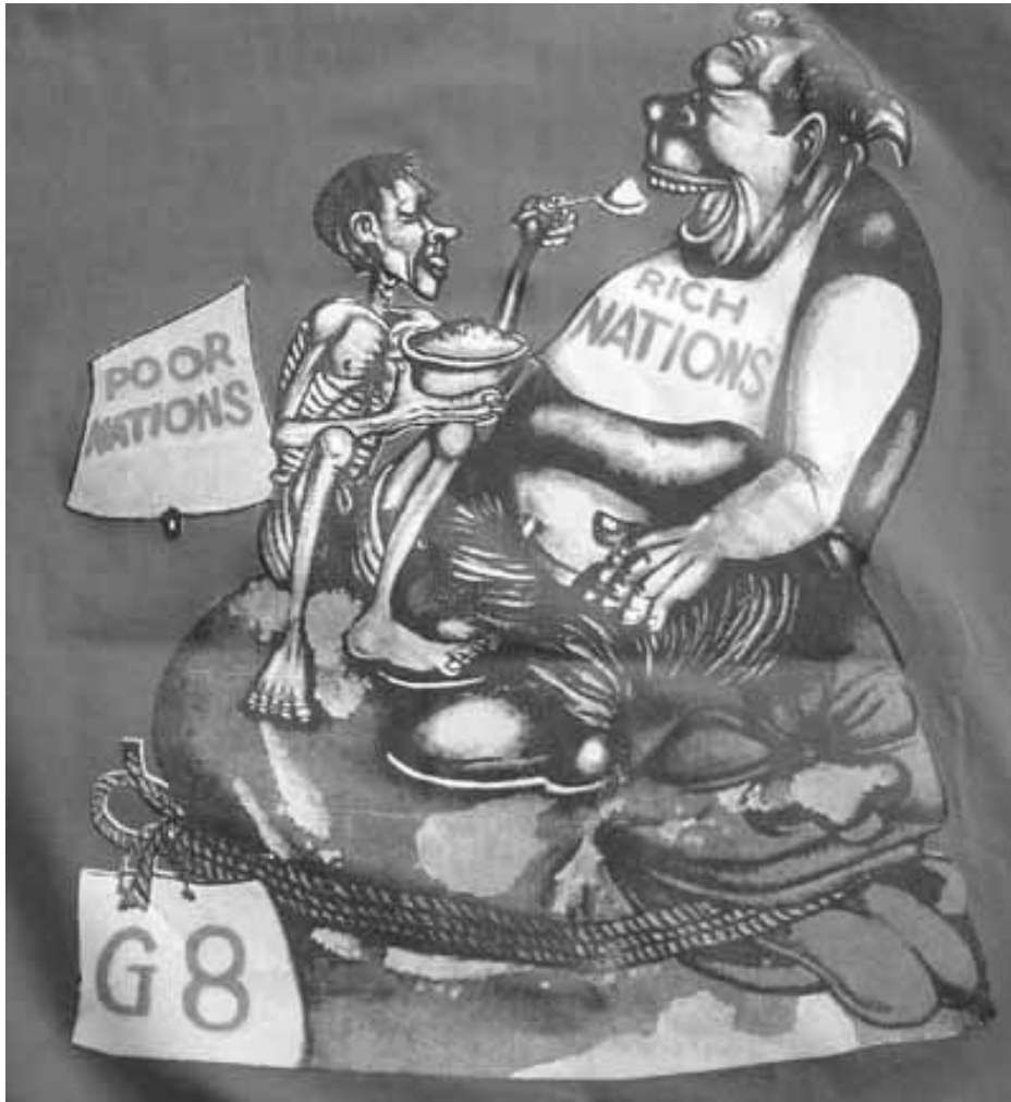
An Indonesian artist created this image calling for debt relief at the recent G8 meeting in Germany.

18 th Sunday in Ordinary Time - August 5, 2007